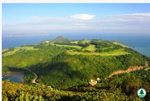
Overlooking Clearwater Bay Golf and Country Club Hong Kong