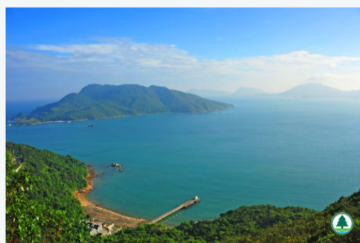
Overlooking Tung Lung Chau