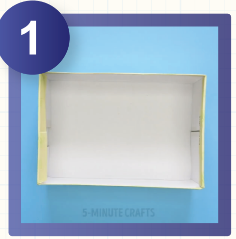
Get an old shoe box and remove the lid.