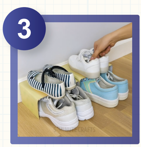
Place disinfected shoes on the shoe rack. Keep your shoes safe and clean!