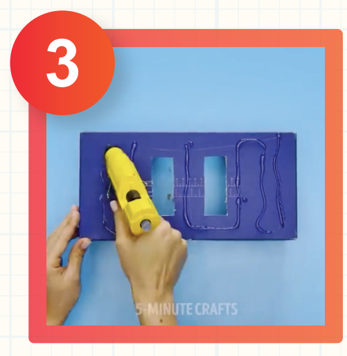
Apply glue on the bottom surface.