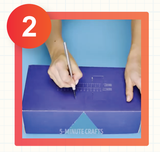
Cut out two rectangles from the bottom surface.