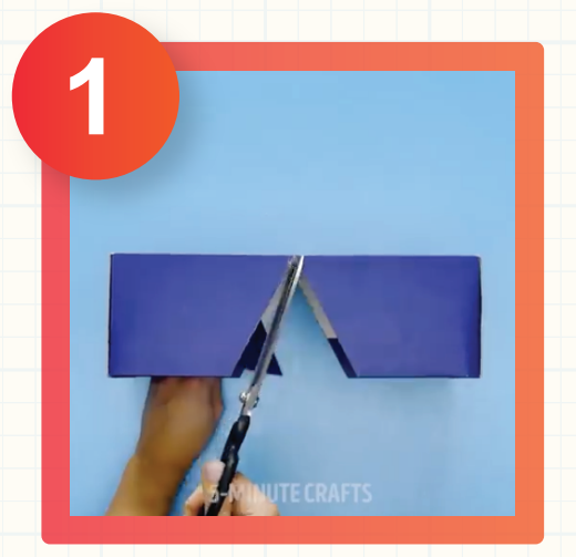
Cut out triangles from the long sides of the shoe box.