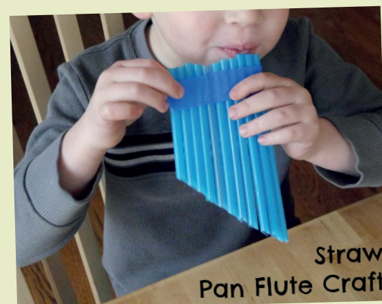
Straw Pan Flute Craft