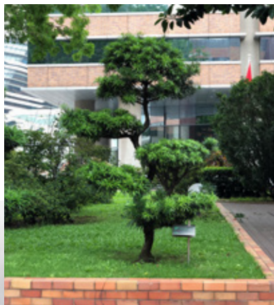
Medium Tree 中樹