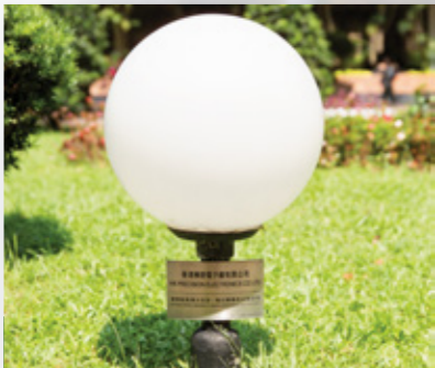
Garden Lamp 花園路燈