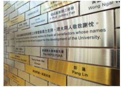
Silver metal nameplate 金屬名牌 (銀色)