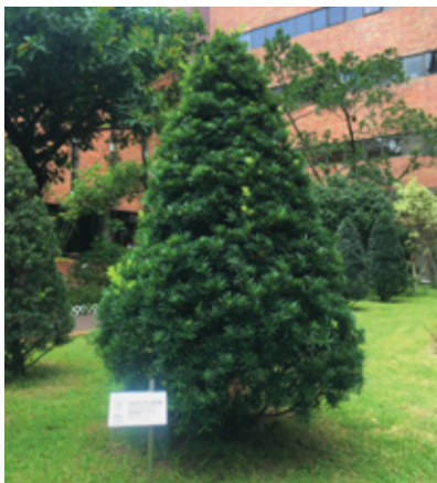
Large Tree 大樹