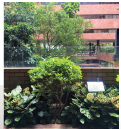
Small Tree 小樹