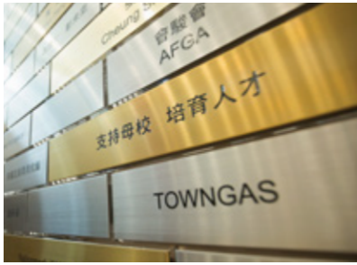
Gold metal nameplate 金屬名牌 (金色)