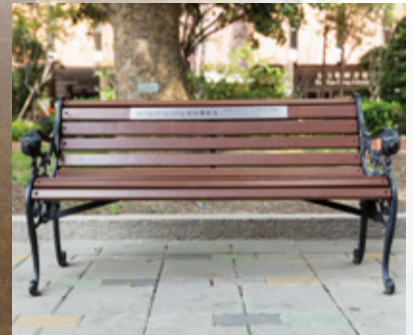
Wooden Bench 木長椅