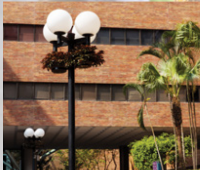
Tall Lamp 高身路燈