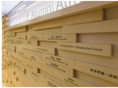
Wooden nameplate 木紋名牌