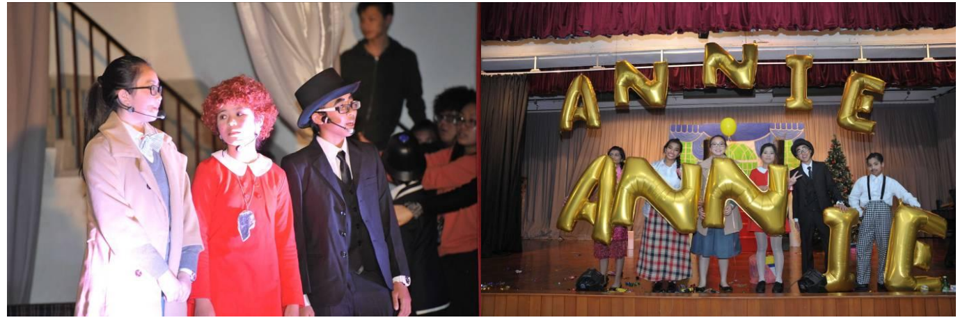
PLK Residential Care Home Drama show 2015 - Annie