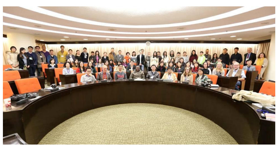
Participants at the 5<sup>th</sup> Polysystemic Language and Education Symposium

Organised by the Department of English of PolyU, and co-sponsored by the Research Grant Council of Hong Kong, the 5<sup>th</sup> PolySystemic Language & Education Symposium & Workshops highlights the theme of "multiliteracies and multimodality in language and education" to cope with the increasing use of multimedia in English Language Teaching. Invited plenary speakers include Prof. Len Unsworth and Dr Kay O'Halloran, who are internationally renowned experts in this area. Speakers from the Chinese mainland and Hong Kong shared their research on various topics and issues in language education. They included Prof. Chang Chenguang (Sun Yat-Sen University), Dr Gail Forey (The Hong Kong Polytechnic University), Dr William Feng (The Hong Kong Polytechnic University), Prof. Ken Hyland (The University of Hong Kong), Ms Bette Li (Education Consultant), Prof. Angel Lin (The University of Hong Kong), Prof. Christian Matthiessen (The Hong Kong Polytechnic University), and Dr Corinne Maxwell-Reid (The Chinese University of Hong Kong).