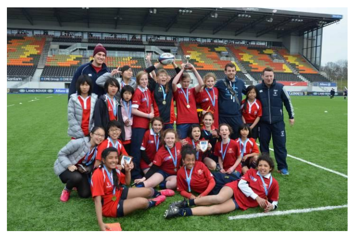
Nervous girls from LTP Residential Care Home on TourAid UK Tour 2014