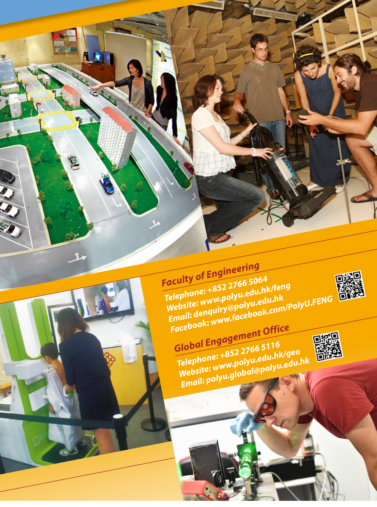
Remark : Information presented in this leaflet is subject to changes and does not form part of any contract between the University and any person.