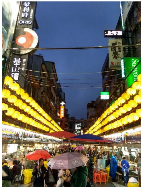
Image 4. Keelung Night Market.

It is very interesting to visit a country which has a similar cultural background as Hong Kong. By comparing them, I understand more about Hong Kong culture.