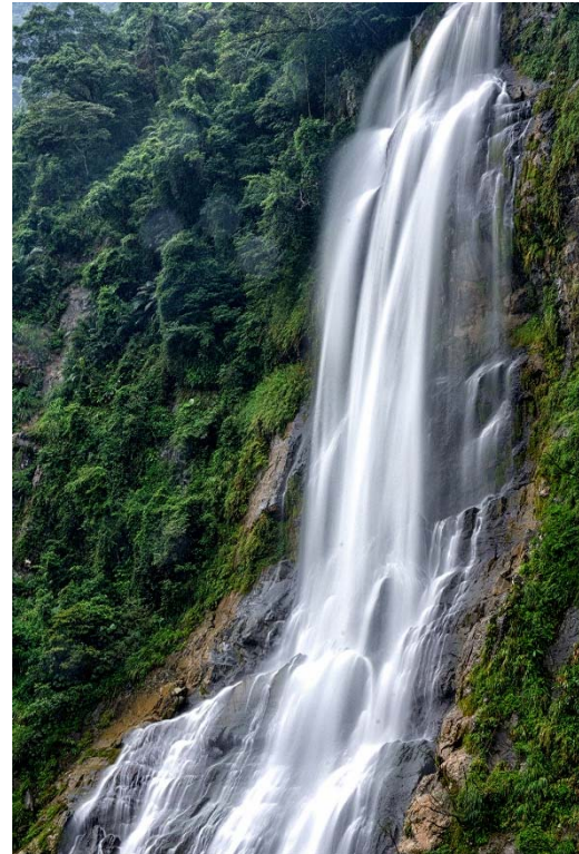
Image 3. Waterfall in Wulai.

Besides, I realized that my career path is not confined to being an electrical engineer. It is more diversified as I thought. Even if I eventually become an electrical engineer, my profession is also not limited to generators and motors. I can focus on robots or even software. I had never imagined the opportunities available.