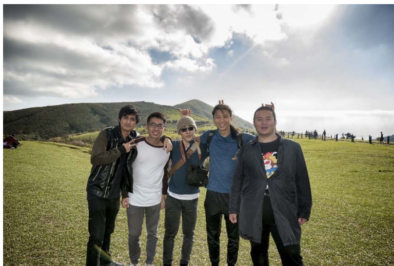
Image 2. Visit Yangmingshan with friends.

I met an exchange student who was enthusiastic about any subject he had taken. He was so passionate that he treated his assignment as his research project. Even the professors