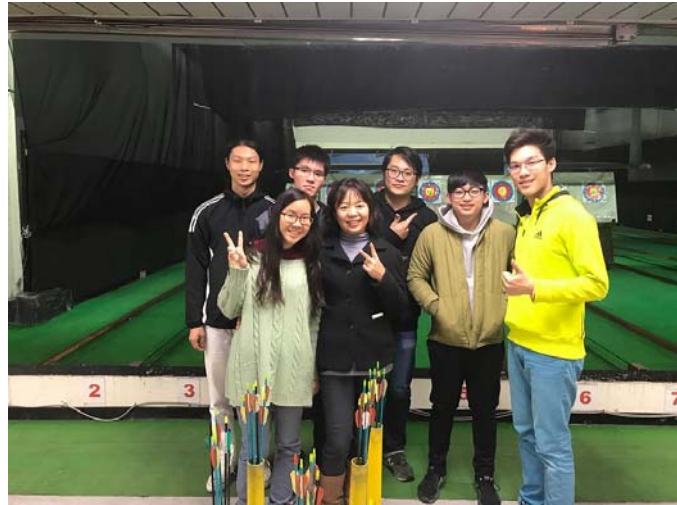
Image 1. Play archery with friends.

However, to be honest, most of my classmates were not of high caliber, even the ones doing master degree. That encouraged me that higher education level is not solely for the top students; if I have the passion, I can still do it.