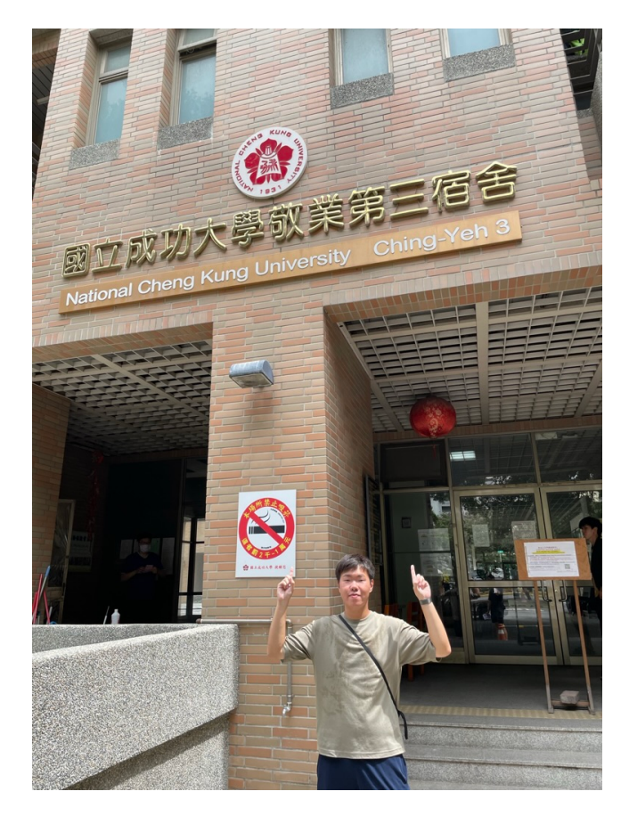
Fig 2. NCKU Ching-Yeh 3 Dormitory

At NCKU, a remarkable learning experience was participating in the AI Cup competition. This nationwide event for Taiwanese university students challenged my AI skills and allowed me to learn from others' unique ideas. Competing with students from across Taiwan provided valuable insights and expanded my knowledge in the field.