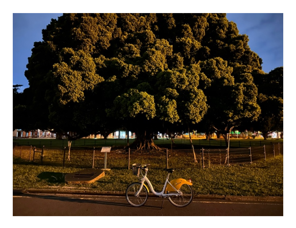
Fig 3. Cycling in the NCKU campus at midnight

I also learnt a lot from my classmates in the host countries. Apart from actively sharing their opinions and insights during class. One incident that left a lasting impression on me occurred when I returned to university at midnight. Despite the late hour, I was astonished to find numerous students studying in the 24-hour study area. Witnessing their unwavering commitment to their studies deeply impacted me. The collective motivation and perseverance exhibited by these students created an atmosphere conducive to academic growth and instilled in me a newfound determination to excel.