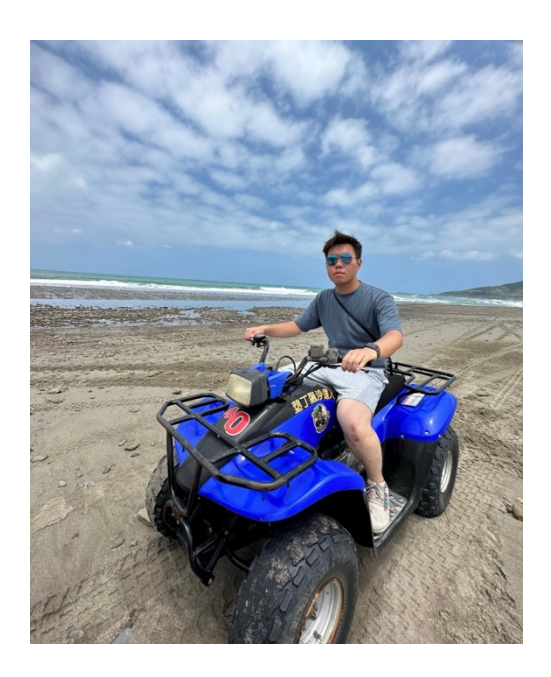
Fig 4. Dune Buggy in Kenting