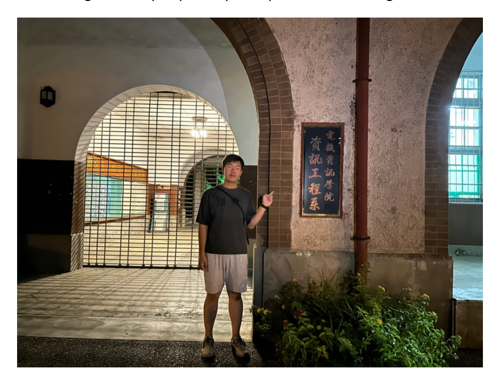
Fig 1. Department of Computer Science and Information Engineering

The academic experience at NCKU brought me new experiences in learning. The university provided ample opportunities for practically applying the knowledge learned from the lectures, which proved immensely beneficial for students' future careers. Engaging in hands-on learning allowed us to grasp the real-world implications of the theories we studied. What particularly struck me was the remarkable learning attitude demonstrated by Taiwanese students. My classmates actively shared their opinions and insights. Their willingness to contribute to the class created a stimulating environment, providing me with valuable perspectives to broaden my own understanding. I am very inspired by their passion for learning.