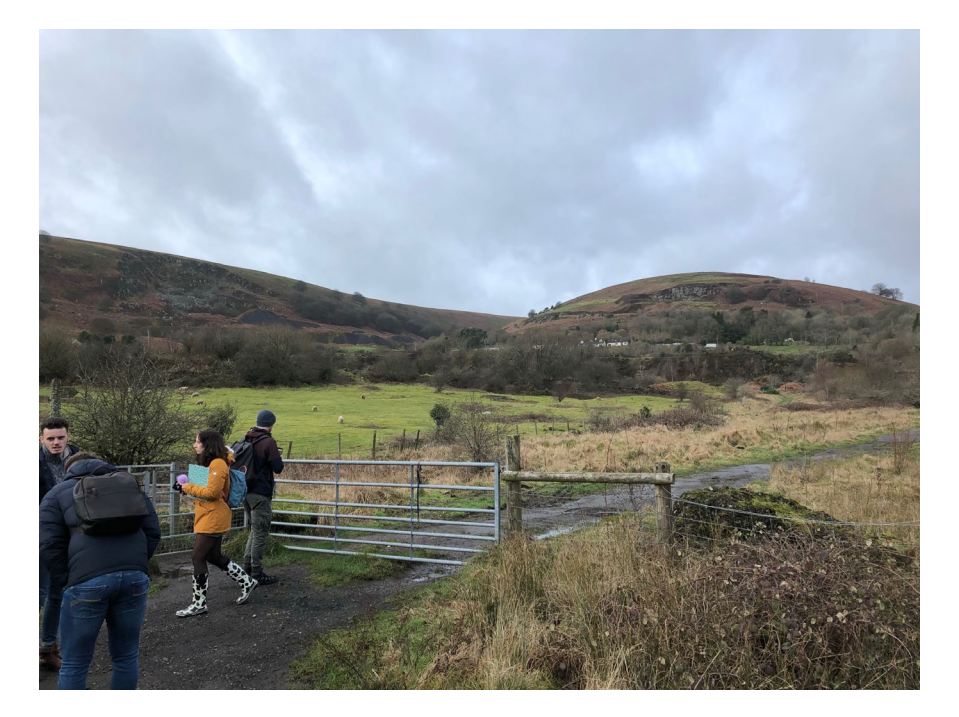
A field trip to the countryside for an urban planning module

The overseas learning experience has really brought to me a lot of new insights. When I attended lectures at Polytechnic University, students including me are used to having a laptop put in front of us and a lot of people are not really paying attention to the lecture. At Cardiff University, lectures are more compact and only take a small amount of time every week, but everyone at the lectures are very attentive and took notes themselves. This has changed my learning behaviour and helped me build a better learning attitude. Their study also contains a lot of field trips to other places.