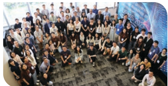
Department of Management and Marketing: PolyU Joint University Summer Workshop on Information Systems 2023 (JUSWIS 2023)