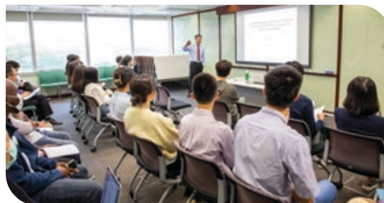
School of Accounting and Finance: Research Seminar for Doctoral Students