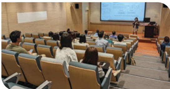
Department of Logistics and Maritime Studies: Research Postgraduate Student Symposium