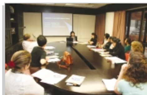
Participants' presentations offer lots of insights in different aspects of English language teaching.

ENGLink is published by the Department of English, The Hong Kong Polytechnic University.