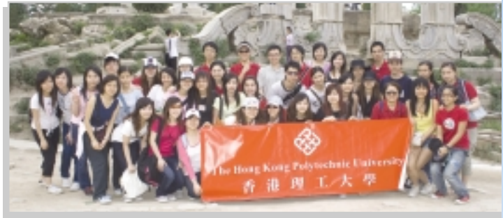
Reviewing history at Yuanmingyuan.

The study trip testified communication skills and teamwork spirit of the HD group, which are the objectives of the programme. It provided a good chance to understand Chinese culture and strengthened the friendship between students and teachers. Although the HDEBC programme has unfortunately come to an end, its graduates will have a good beginning in their career.