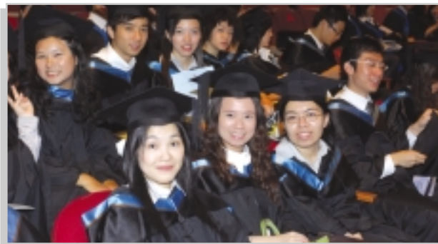
What a great day! Smiling faces can be seen everywhere.