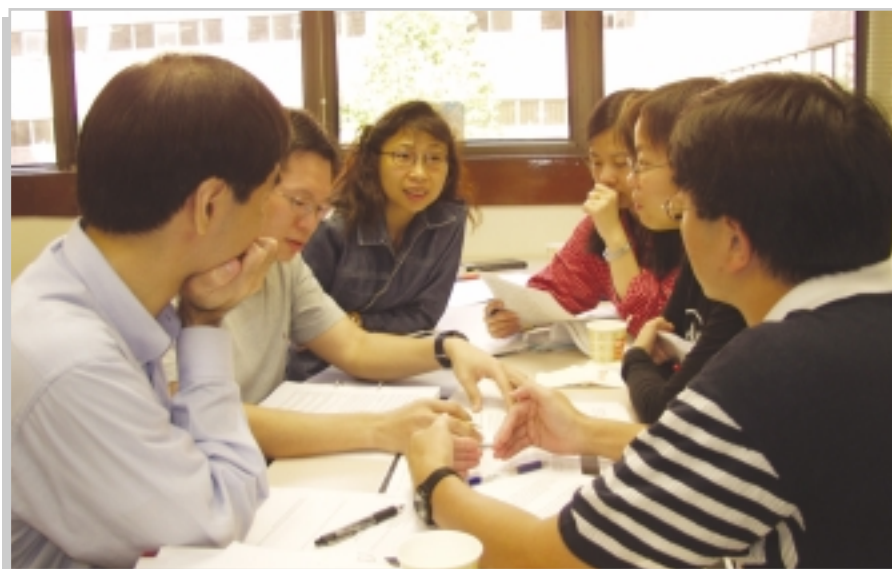
By taking individual subjects and making use of the credit transfer opportunity, it sets a good starting point for subject-based students to achieve an academic award as other regular students.

ENGL currently offers one top-up undergraduate programme and four postgraduate programmes on self-financed basis. Alumni can get more information about the subjects offered in these programmes under http://www.engl.polyu.edu.hk/Courses/index.html . Enquiries on admission of subject-based students and the Alumni Sponsorship scheme can be forwarded to egdept@polyu.edu.hk .