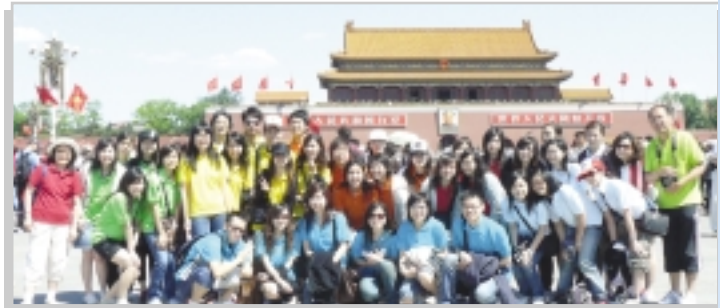
In the colour of Olympics.