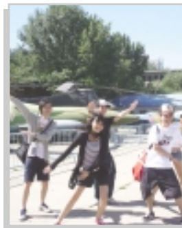
We can fly.