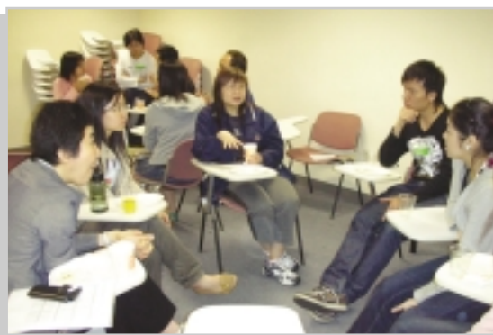
The career experience sharing session helps mentors and mentees engage in active discussion about job and personal development.