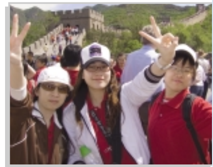
We can win.