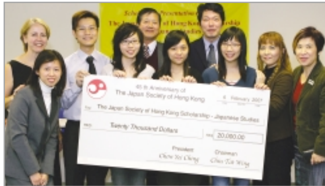
Staff and students of ENGL are grateful for the scholarship from the Japan Society of Hong Kong

The Japan Society of Hong Kong presented HK$20,000 scholarship to ENGL in February to encourage those students studying Japanese in the department to pursue excellence in their academic and personal development. Three awards of HK$10,000, HK$6,000 and HK$4,000 will be granted to the nominated students on the basis of academic merits, community involvement and leadership accomplishments.