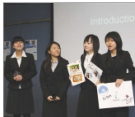
The other 2 teams, Gouté Café and Beautographer, also make very professional presentations and they all treasure this opportunity to put the things they learnt into practice.