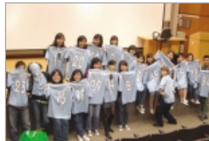
What a big cheering team! Every team member printed their name at the back of the uniform to show their committed support.