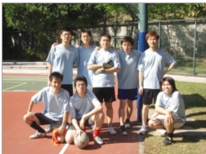
Go goal! BALSB boys enjoy the time playing football together.