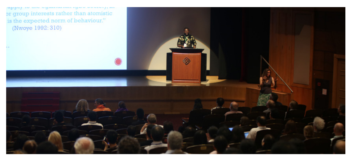
The conference's six plenary lectures attract 300 – 400 participants each.

The 16<sup>th</sup> International Pragmatics Conference (IPrA 2019) was organised by the International Pragmatics Association (IPrA) and hosted by the Department of English from 9-14 June 2019, with sponsorship from the Research Centre for Professional Communication in English (RCPCE), the Hong Kong Academy of the Humanities (HKAH), and John Benjamins Publishing Company. This year's theme – Pragmatics of the Margins – reflects Hong Kong's unique position as a place where post-coloniality, marginalisation, and entanglement inform public discourse. The conference is an important networking platform for interdisciplinary scholarly exchange and collaboration in the field of linguistics. It also provides scholars with a snapshot of current trends and developments in the academic fields of inquiry and teaching. The conference was attended by over 950 scholars from 55 countries and regions.