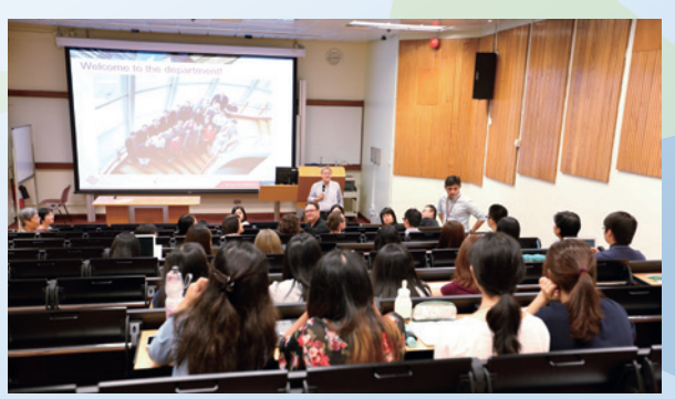
Academic staff have a chance to talk to the new students at the orientation session.

New students of BA in English Studies for the Professions were given an introduction to the programme curriculum structure and study pathways during the orientation. The students were also briefed on different programmes available to them during their study including overseas exchange, service learning, and Work-Integrated-Education (WIE). They were also able to meet the academic staff who will be teaching them in the coming three years.