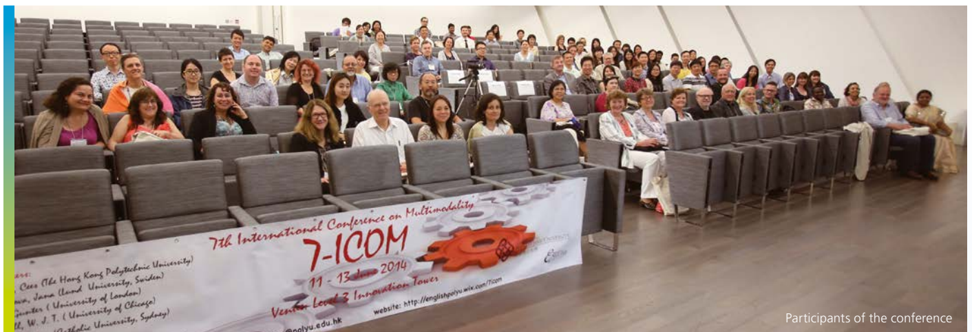
Participants of the conference