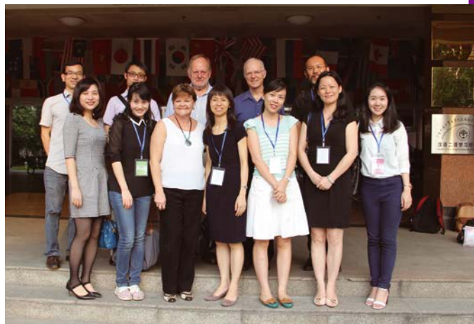
Speakers of the Forum and staff of GDUFS