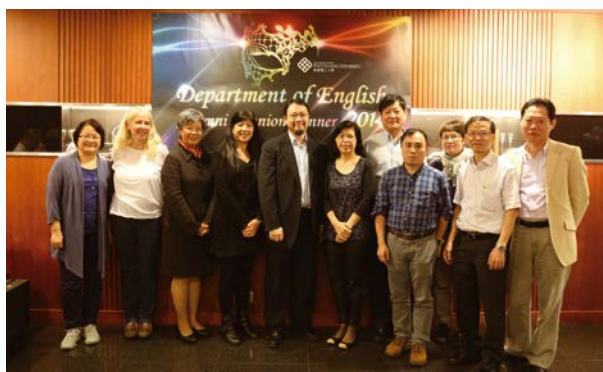
Alumni are able to meet and catch up with their previous teachers at the event.

About 50 alumni and academic staff had a joyful evening at the Alumni Reunion Dinner jointly organised by the Department of English Alumni Association (DEAA) and the Department on 9 May. The theme was 'Masquerade' and each participant received a beautiful mask at the reception to wear during the dinner. Everyone appeared to have a glamorous "make up" and showed a different look! The Alumni Affairs and Development Office (AAO) has sponsored prizes for the game and lucky draw sessions and brought exciting moments to the occasion.