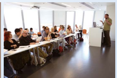
One of the parallel sessions