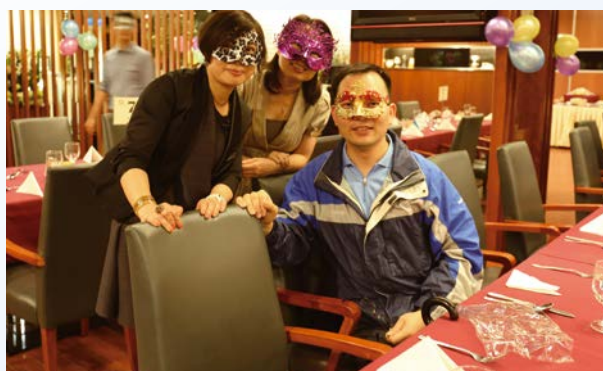
Every participant wears an eye-catching mask!