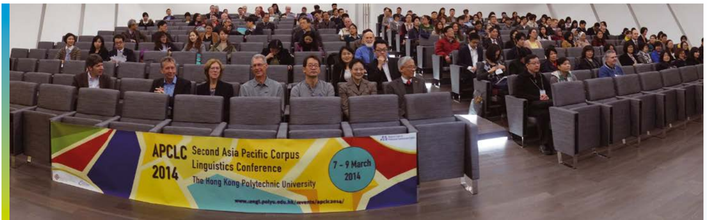
Participants of the conference