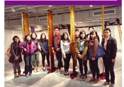
Students from the Intermediate Spanish II course visit the Tormentas y Sueños (Storms and Dreams) Exhibition organised by the School of Design.

For students of the intermediate level courses, they were working hard to become the most outstanding student of Spanish of 2014. Interviews for the best three will take place in April at the Spanish Consulate, who sponsors the HK$10,000 prize.