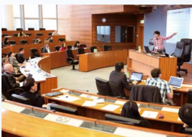
Conference workshop held on 9 March 2014