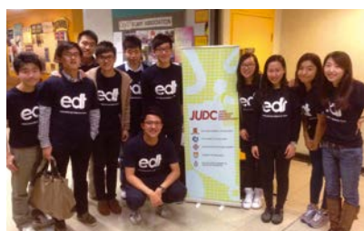
JUDC gives the EDT members a valuable learning opportunity.