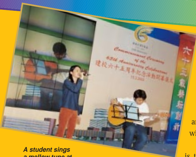
A student sings a mellow tune at the ceremony.