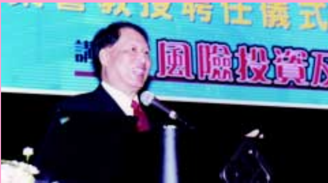
Prof. Cheng Siwei delivers a talk at PolyU.

Known as the "Father of Venture Capital Development in China", Prof. Cheng described the entry as a win-win situation for both China and the world economy. He said, "The accession to the WTO would inevitably pose pressure on some traditional industries such as agriculture, automobile and petroleum industries. However, globalisation is indeed the world trend and no one could oppose or resist such force. The later the