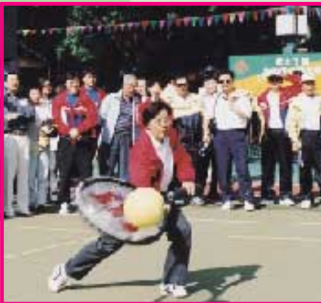
The Hon. Mrs Rita Fan, President of the Legislative Council, in action.

The event has successfully raised over HK$1 million.