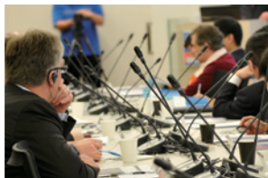
Faculty of Humanities