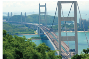
Faculty of Construction and Environment