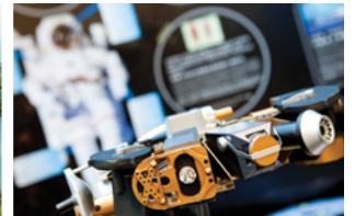
Faculty of Engineering