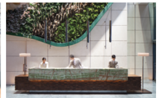
School of Hotel and Tourism Management