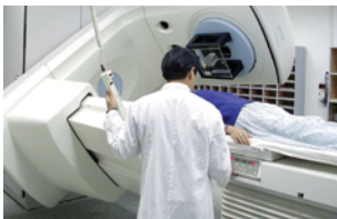
Faculty of Health and Social Sciences