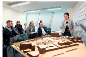
School of Design