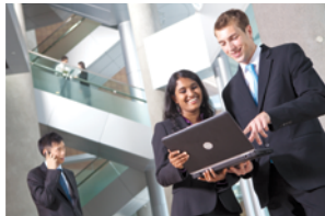
Faculty of Business