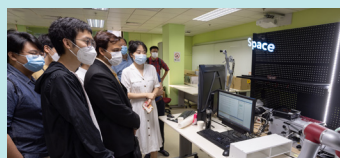
Research Centre on Data Science and Artificial Intelligence (RC-DSAI)