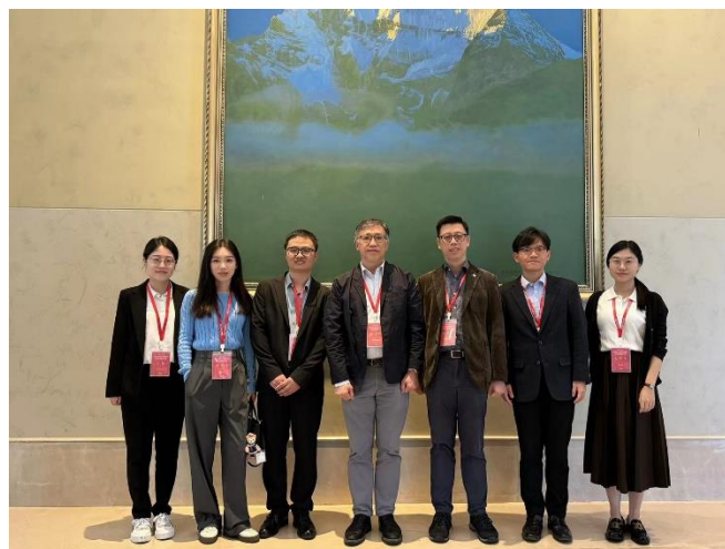
Group photo of CNERC delegates