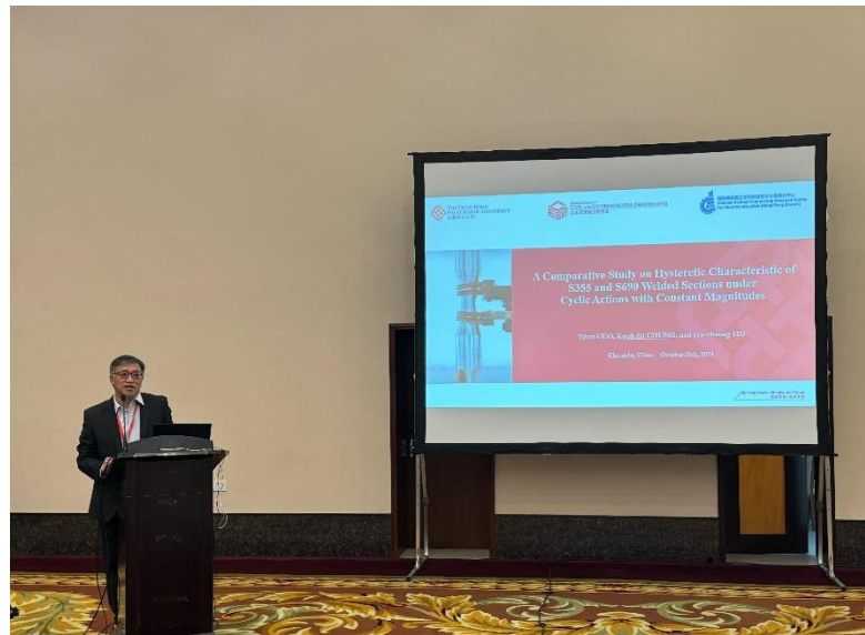
“A Comparative Study on Hysteretic Characteristic of S355 and S690 Welded Sections under Cyclic Actions with Constant Magnitudes” by Prof. K.F. Chung

Five technical presentations were presented by CNERC delegation during the PSSC 2022 Conference on 28 October 2023 as follows: