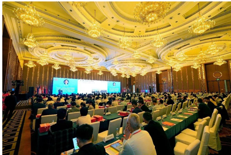
A photo taken during the Annual Conference of China Steel Construction Society 2023