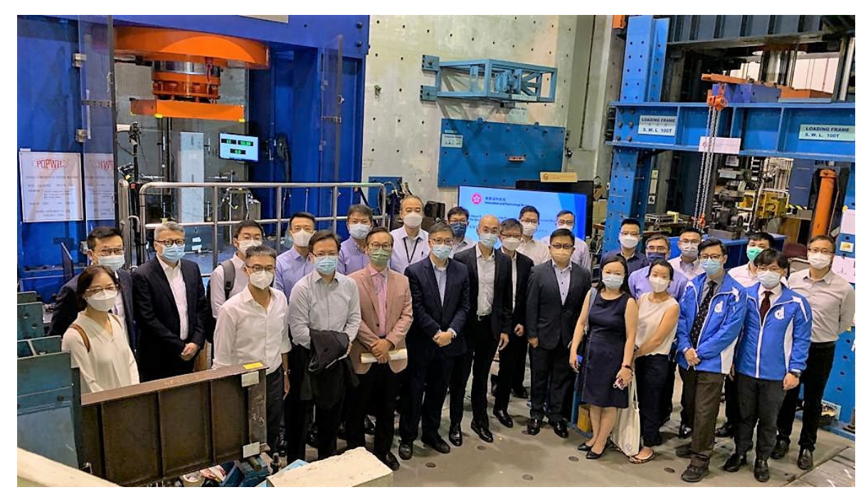
A group photo of CEDD and PSGO delegates together with CNERC office bearers