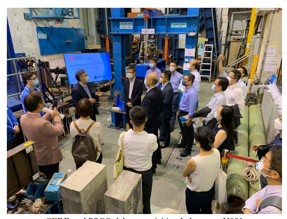
CEDD and PSGO delegates visiting Laboratory Y001

The delegates visited the Structural Engineering Research Laboratory, Laboratory Y001, of the PolyU, and were briefed about the research and testing capabilities of the CNERC for large-scale structural tests. The delegates were also introduced to a number of research and development projects on high strength S690 and S960 steels.