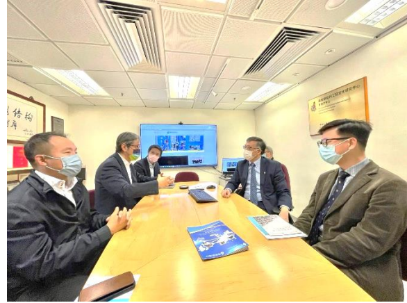
The Delegation Team had a discussion on possible collaboration with CNERC.