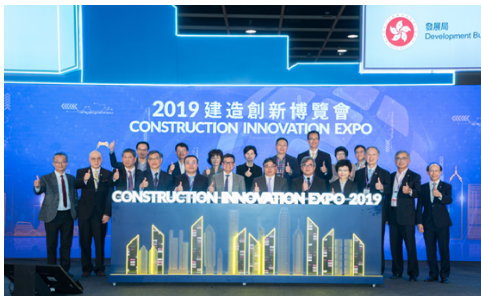
Soft Opening Ceremony of CIExpo 2019.