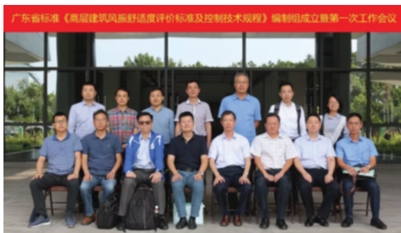
Group photo of the Project Team