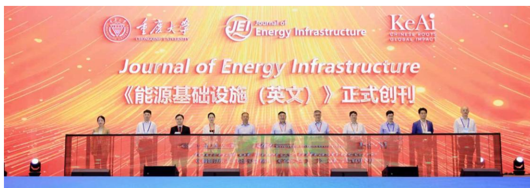
Inauguration of JEI during Opening Ceremony of “ Third Academic Forum on Mountainous Civil Engineering ”