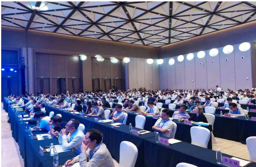
“Third Academic Forum on Mountainous Civil Engineering” held at the Chongqing Science Hall