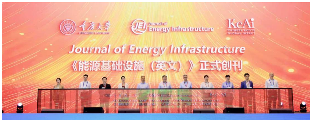
Inauguration of JEI during Opening Ceremony of “ Third Academic Forum on Mountainous Civil Engineering ”