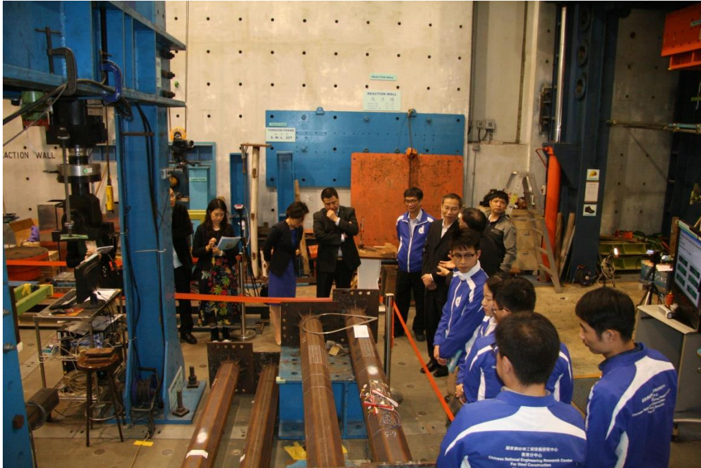
The Shougang Group delegates visited the Structural Engineering Research Laboratory, PolyU.