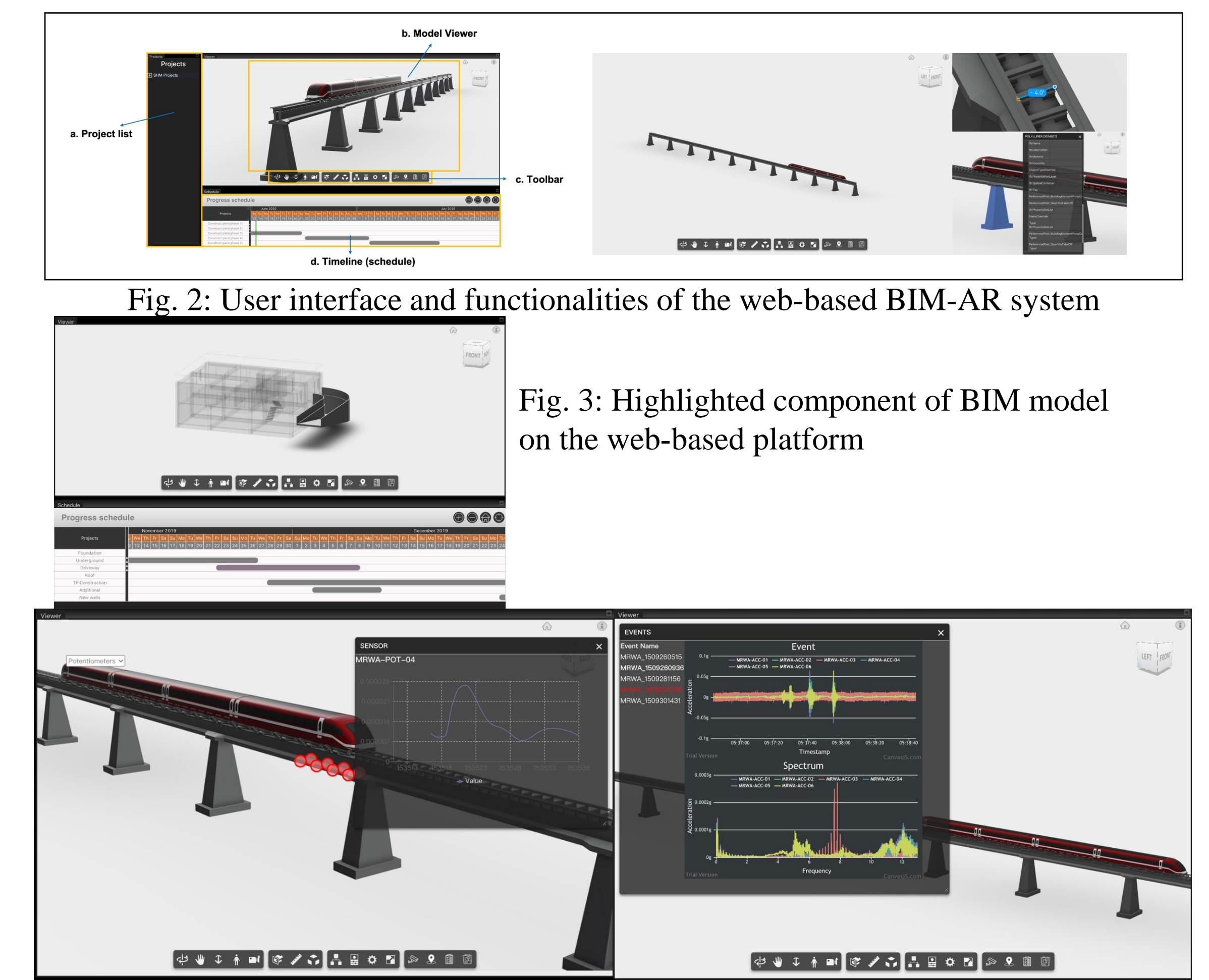
Fig. 4: Sensor monitoring and simulation on BIM-AR

AR display is adapted to superimpose structural conditions with the actual structure, to enhance the perception ability of field inspectors. It is designed to help conduct a more accurate inspection to reduce time waste and save costs. Inspectors can check the positions and readings of the sensors in the AR app as shown in Fig. 5a and Fig. 5b. If the inspector wants to know which sensor has abnormal data, thresholds can be preset based on the different types of sensors as demonstrated in Fig. 5c. Inspectors are allowed to send Inspection reports with the information of inspectors, locations, captures, and description to the web-based platform through the AR app. Users of the web-based platform can check the absolute location of the report in BIM model through the platform (Fig. 6).