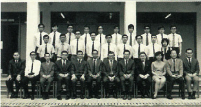
Building/Surveying 1968-1971 Graduates Hong Kong Technical College