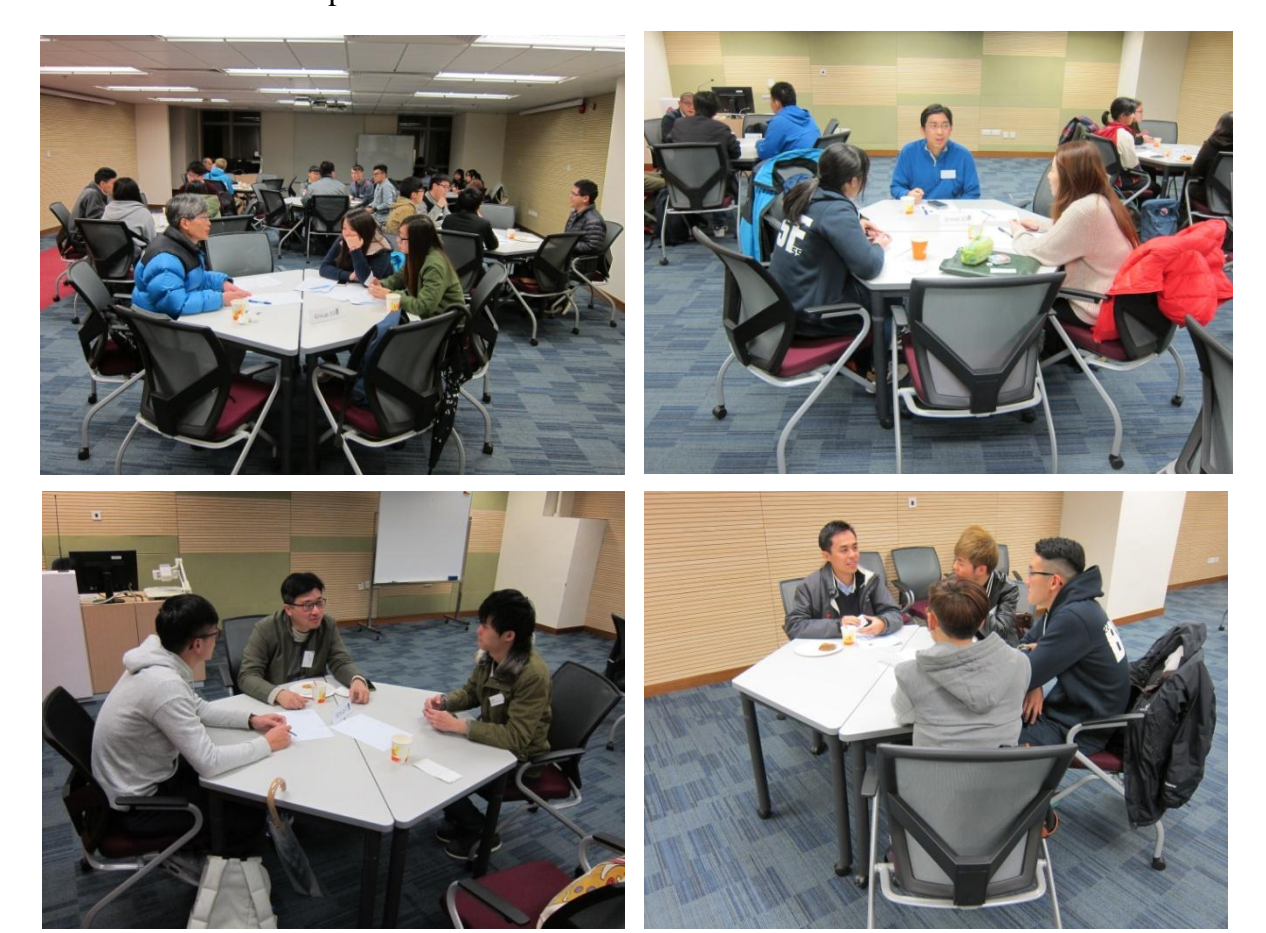
The sharing session of the mentors and mentees

Immediately after presenting the certificates, a lively sharing session was held between the mentors and mentees. The mentors shared their valuable learning and working experience. The mentees showed strong interest in knowing more about the challenges that they might encounter in the work place.