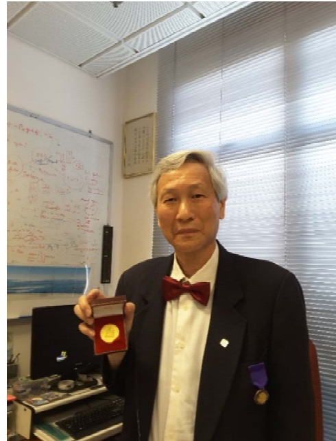
The Gold Medal