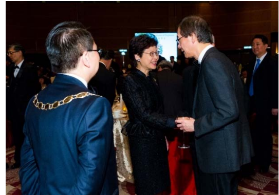
Address by the Hon Chief Executive