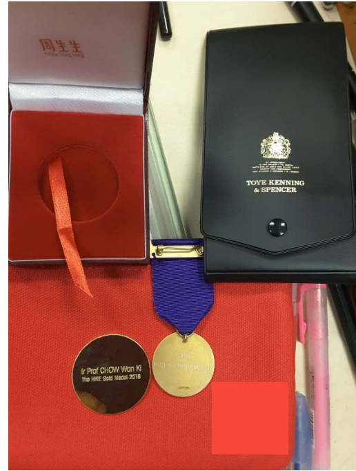
Awards: Gold Medal and Badge

A brief summary is available on the HKIE website: