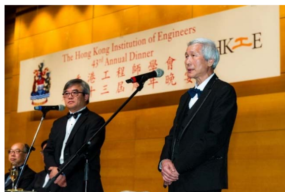
Thanks to BSE and FED