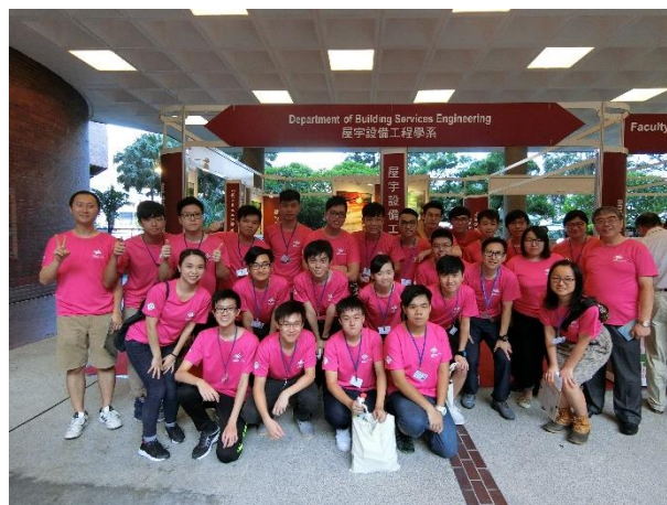
BSE student ambassadors and staff members in Info Day

We would like to express our greatest gratitude and appreciation to all colleagues, alumni, guests and student ambassadors for their enthusiastic participation in the Info Day. We believe that the PolyU Education Info Day has successfully facilitated prospective students' understanding of our Department and academic programmes. We look forward to welcoming them to join our programme in the near future.