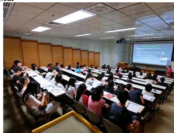
Prospective students and parents at info seminars