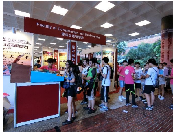
BSE game at exhibition booth

Two information seminars with the theme “Building Services Engineering: A Bridge to a Lifelong Exciting Career” were held in the morning and afternoon sessions. Interested parents and students were provided with in-depth idea of the Department, building services engineering and our programme. The professionalism and career prospects were also highlighted in the presentation.