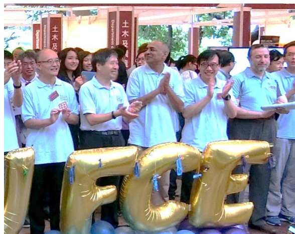
FCE Opening Ceremony