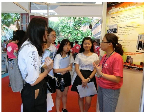
Advice to prospective students at BSE exhibition booth

The exhibition booth aimed to showcase BSE programmes and the unique features in teaching and learning, invention of BSE, student activities such as WIE and student exchange programme, and facilities in BSE to the public.