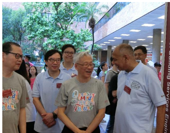
DP's Tour to BSE exhibition booth

The Info Day was featured by a wide variety of events including programme information seminars, exhibition booth, game and guided laboratory visits, which deepened visitors' understanding of BSE programmes.