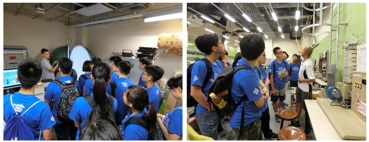
Summer Programme students actively participating in the guided laboratory tour

During the afternoon session, the student group visited Ma Wan Theme Park to explore the Renewable Energy Technologies and their applications in Hong Kong.