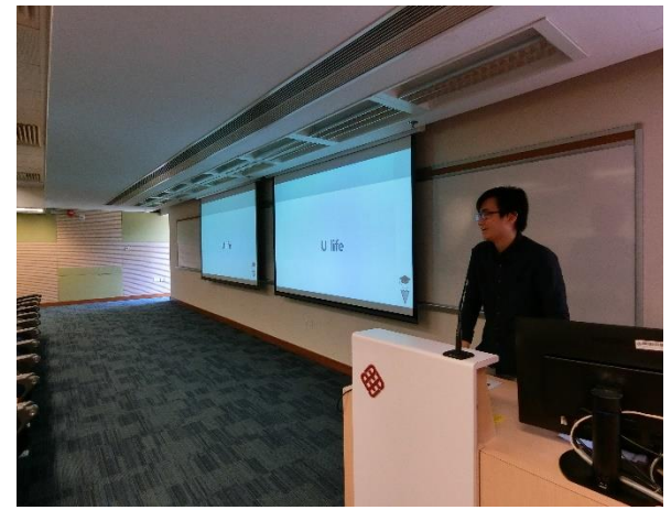
Current year-1 student Herman TSUI's sharing