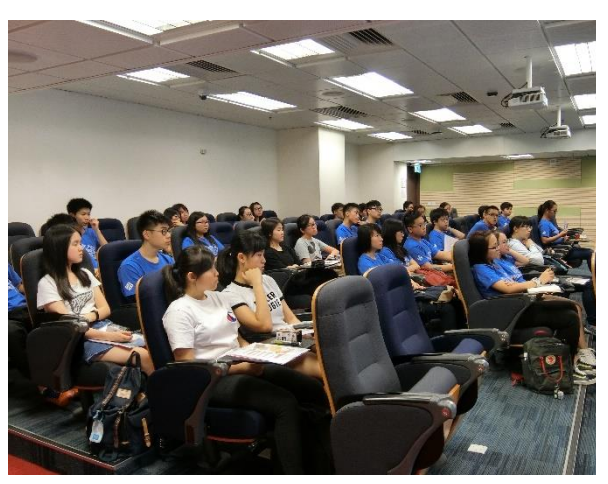
Summer Programme students

The group was guided to tour the BSE laboratories so as to have a deeper understanding of our Department shortly afterwards. How teaching activities and applied research could be better conducted with the laboratories were explained and demonstrated. Students were strongly interested in the tour and they raised meaningful questions.