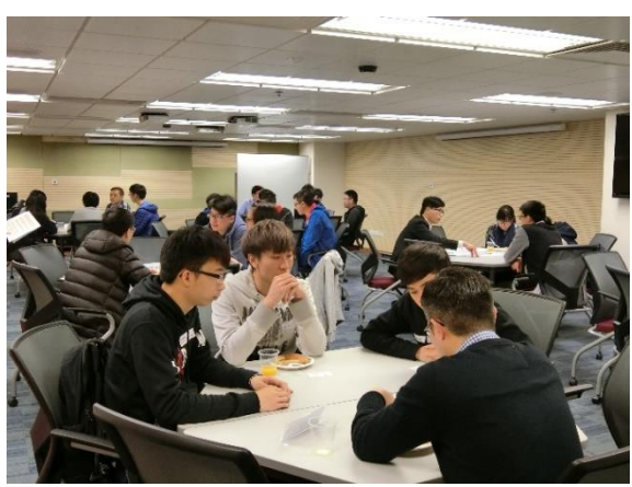
The sharing session of the mentors and mentees