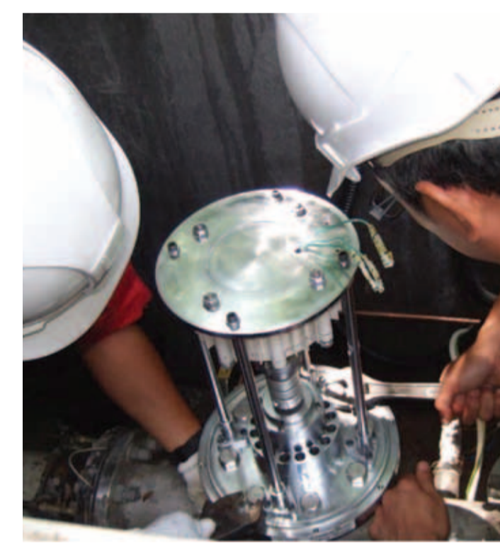
採用微型發電機，適合在狹窄的地下水管空間安裝 The hydro generator system is compact for installation in the narrow underground space of water mains pit

Patent Application No.: HK1150355 Country: (Hong Kong)