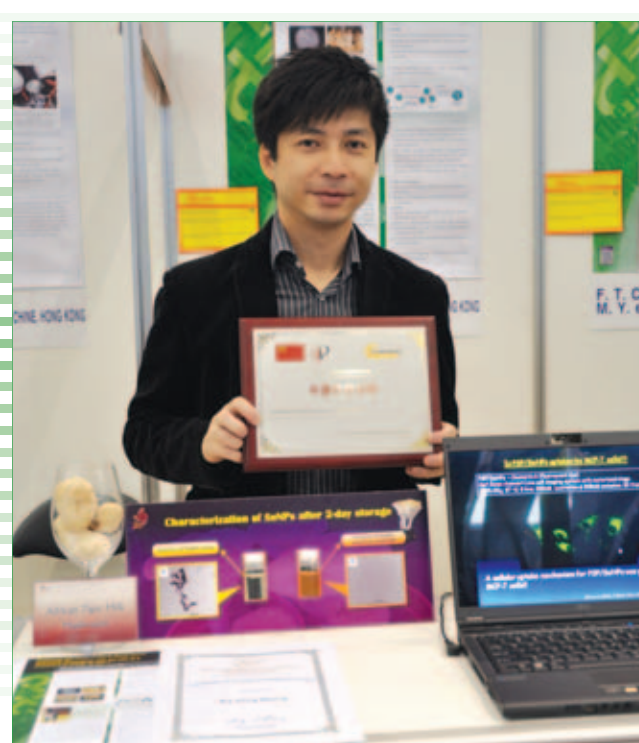
第40屆日內瓦國際發明展-中國代表團獎 Prize of the Chinese Delegation of the Exhibition, 40th International Exhibition of Inventions of Geneva, Switzerland

Recently, selenium nanoparticles ( SeNPs ) have become a new research target, since they were found to possess excellent bioavailability, low toxicity and remarkable anti-tumor activity. Nevertheless, SeNPs aggregate easily and their anti-tumor activity will be significantly reduced, once their nano-size could not be maintained. By using the PSP isolated from mushroom sclerotia of Pleurotus tuber-regium , highly stable SeNPs were successfully prepared under a simple food-grade redox system. Besides, these novel SeNPs were found to remarkably inhibit the growth of human breast carcinoma MCF-7 cells by apoptosis induction in a dose-dependent manner, but were non-cytotoxic toward the normal cells.