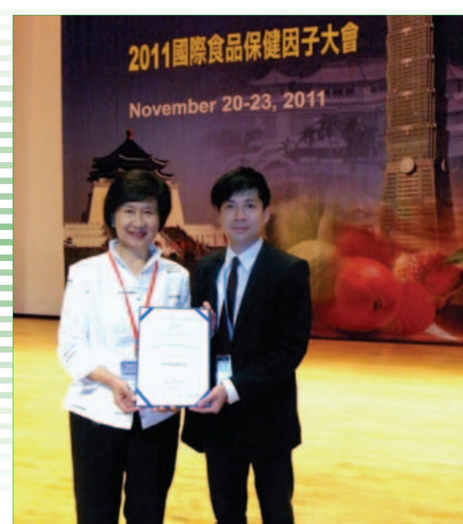
2011國際食品保健因子大會-青年科學家獎 Young Investigator Award - 2011 International Conference on Food Factors