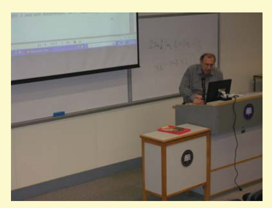
Plenary Lecture by Demetrios Christodoulou (ETH Zurich): Title: The formation of black holes in general relativity