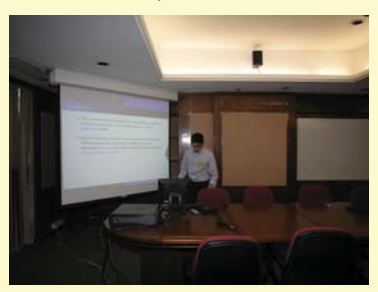
CHAN, Yat-Ming (HKU)