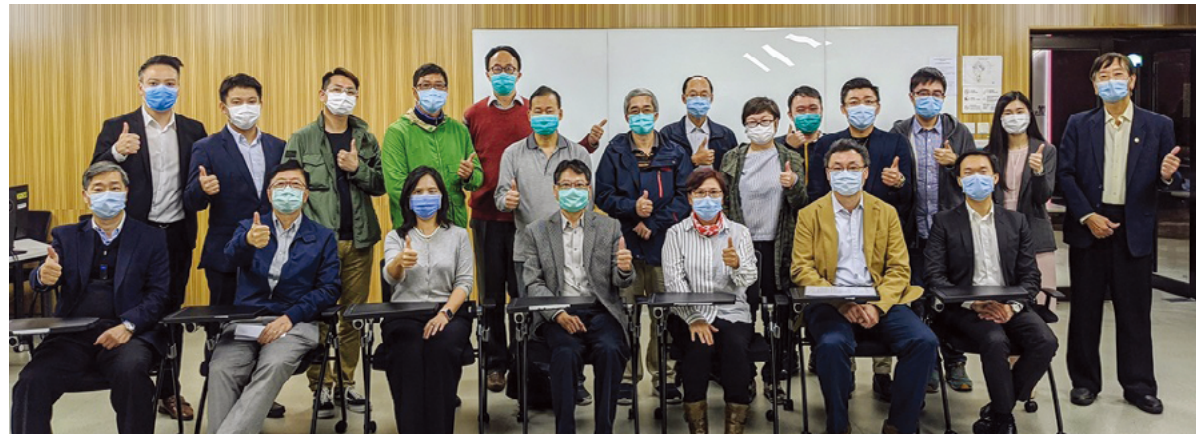
理大校友會聯會 2019/2021 年度理事履新