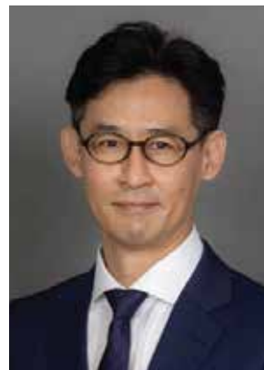
Programme Leader 课程负责人

As you embark on this intellectual adventure, we encourage you to embrace curiosity, creativity, and a deep commitment to making a positive impact on our planet. Together, we will shape a sustainable tomorrow for generations to come. Welcome, and let's take bold steps towards carbon neutrality!