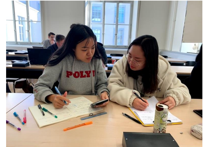
Academic Discussion in Switzerland