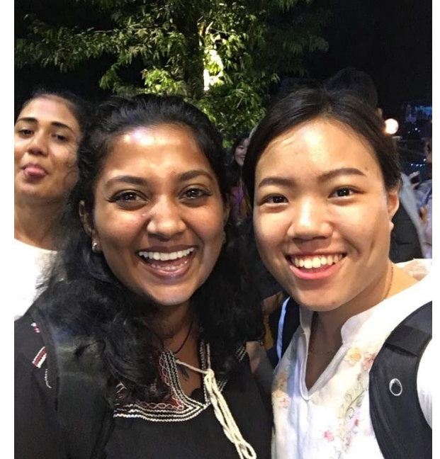
Selfie with Sri Lanka peers