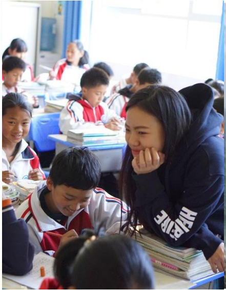
Yunnan: Voluntary Teaching