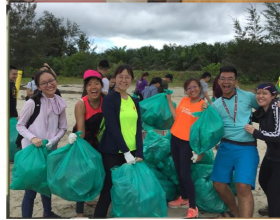
Beach Cleaning in Hometown