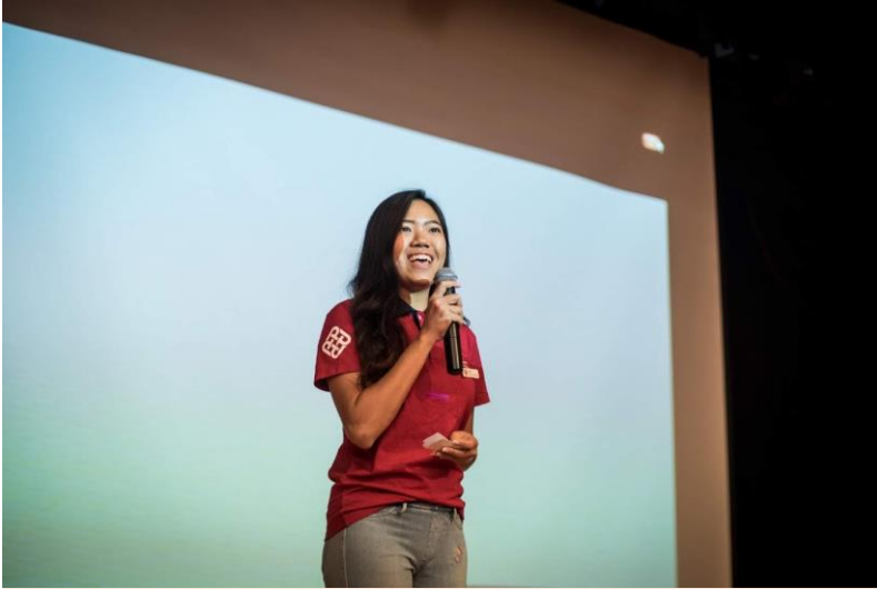
Emcee & Student Sharing