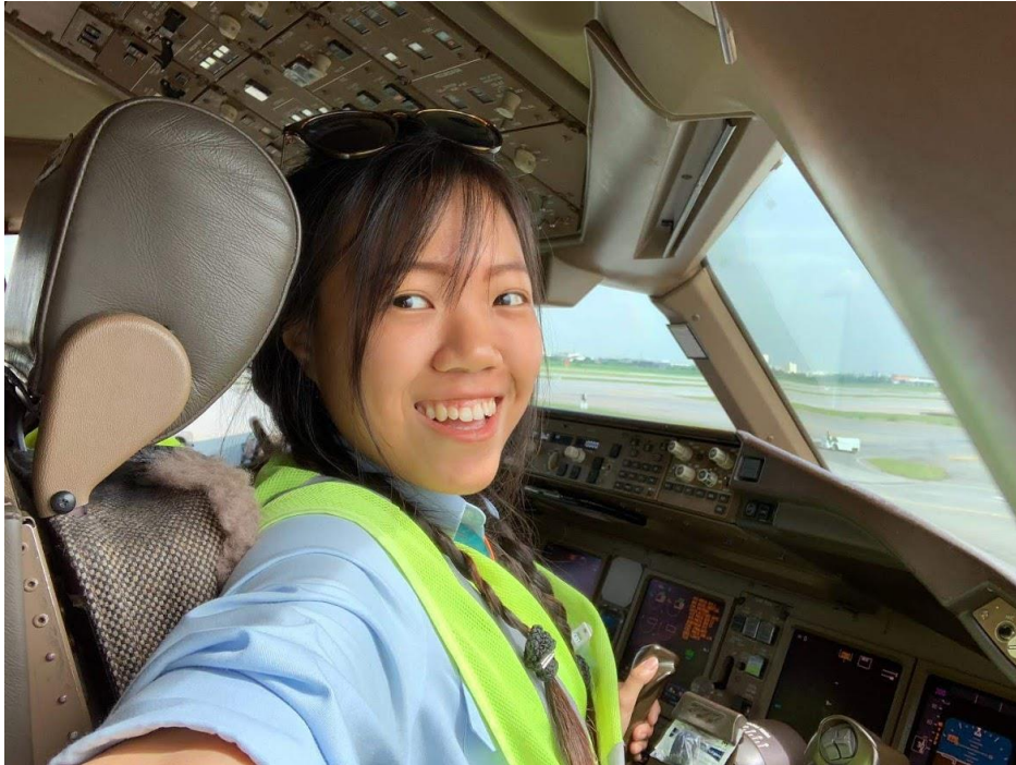
Aircraft Maintenance Engineering Internship in Bangkok Suvarnabhumi Airport for Cathay Pacific