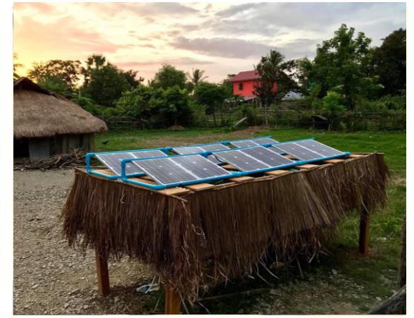
Solar Panels Station built