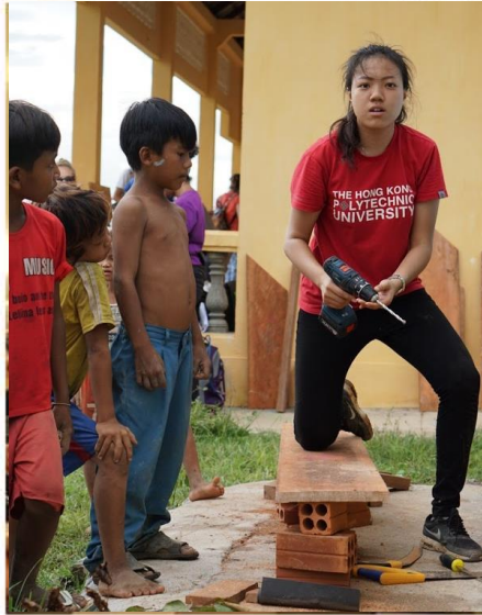
Cambodia: Building Learning Centre