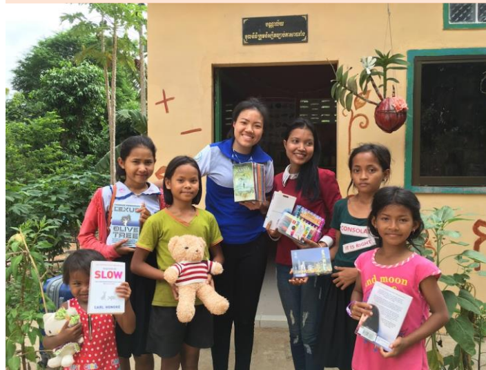
Self-initiated Book Donation Campaign