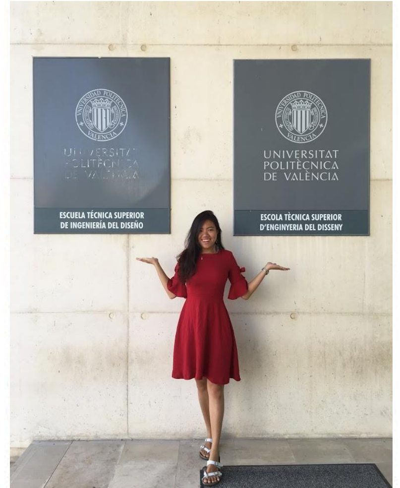
Research on unmanned vehicle in Polytechnique University of Valencia, Spain