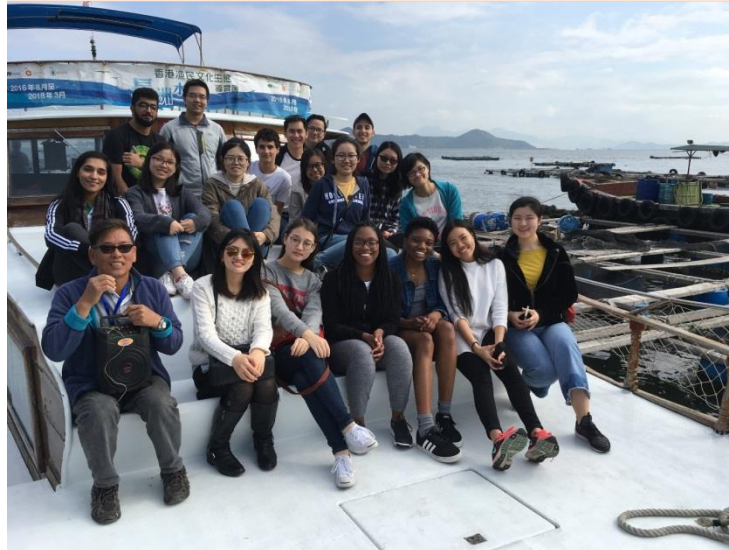
Organized a trip to Cheung Chau