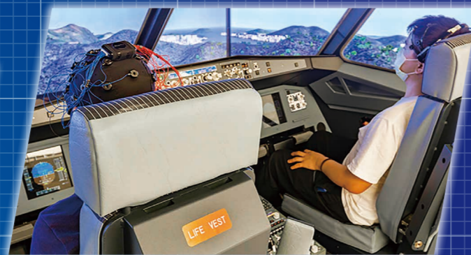
Human factors research equipment