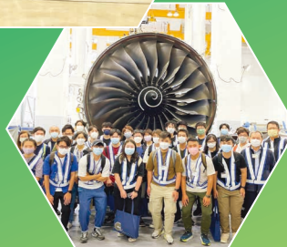
Industrial visit to Hong Kong Aero Engine Services Limited (HAESL).