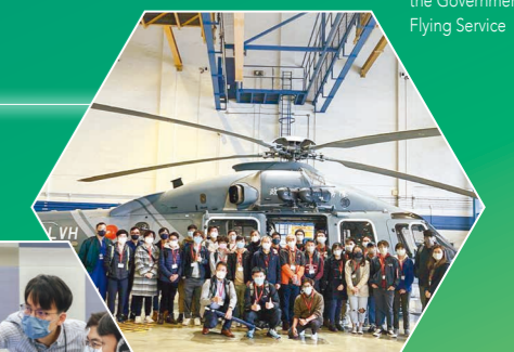
Industrial visit to the Government Flying Service

The Department actively organize industrial visits to local aviation companies, including HAECO, HAESL, HKCAD etc., to encourage active learning and provide students with a chance to meet industrial leaders in the field.