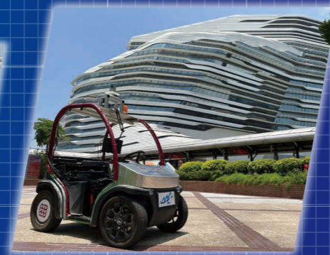
Autonomous driving test platform