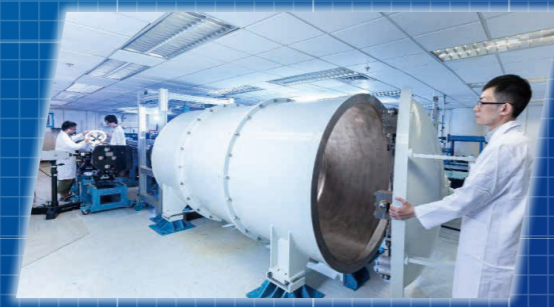
Supersonic wind tunnel