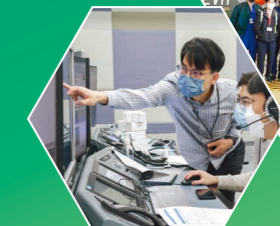
Industrial visit to the Civil Aviation Department