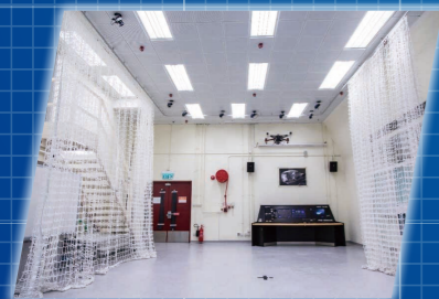
UAV - VICON - indoor motion capture system