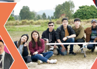
AAEOLUS – PolyU's AIAA Design, Build and Fly competition team