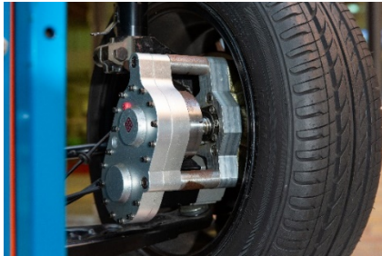
All-electric Antilock Braking System

This all-electric Anti-lock Braking System (ABS) considers road conditions and calculates the maximum tire-road adhesion coefficient in order to control the angular wheel acceleration and generate an accurate braking torque with its electric control unit. Compared with conventional hydraulic ABS, this all-electric system is more environmentally friendly, safer, more responsive and more accurate in braking torque control, thus effectively shortening the braking distance and time.