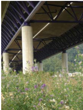
Lully Bridge, Switzerland

Specific topics include applications, design resources, static design of tubular members and joints, fatigue design of tubular joints. It also presents new developments such as SCC filled double skin tubes, thick-walled tubular structures and FRP strengthening.