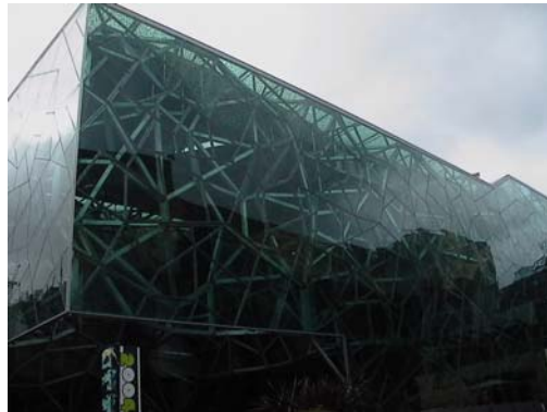
Federation Square, Melbourne