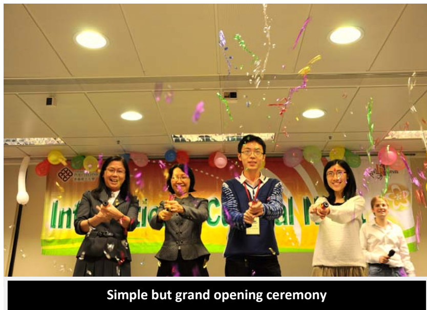
Simple but grand opening ceremony

An enchanting night for cultural exchange