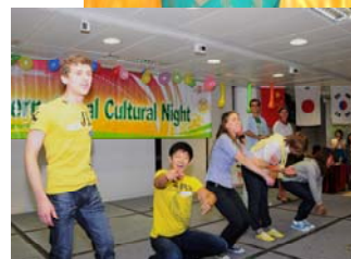
Marvellous performance of non-local students