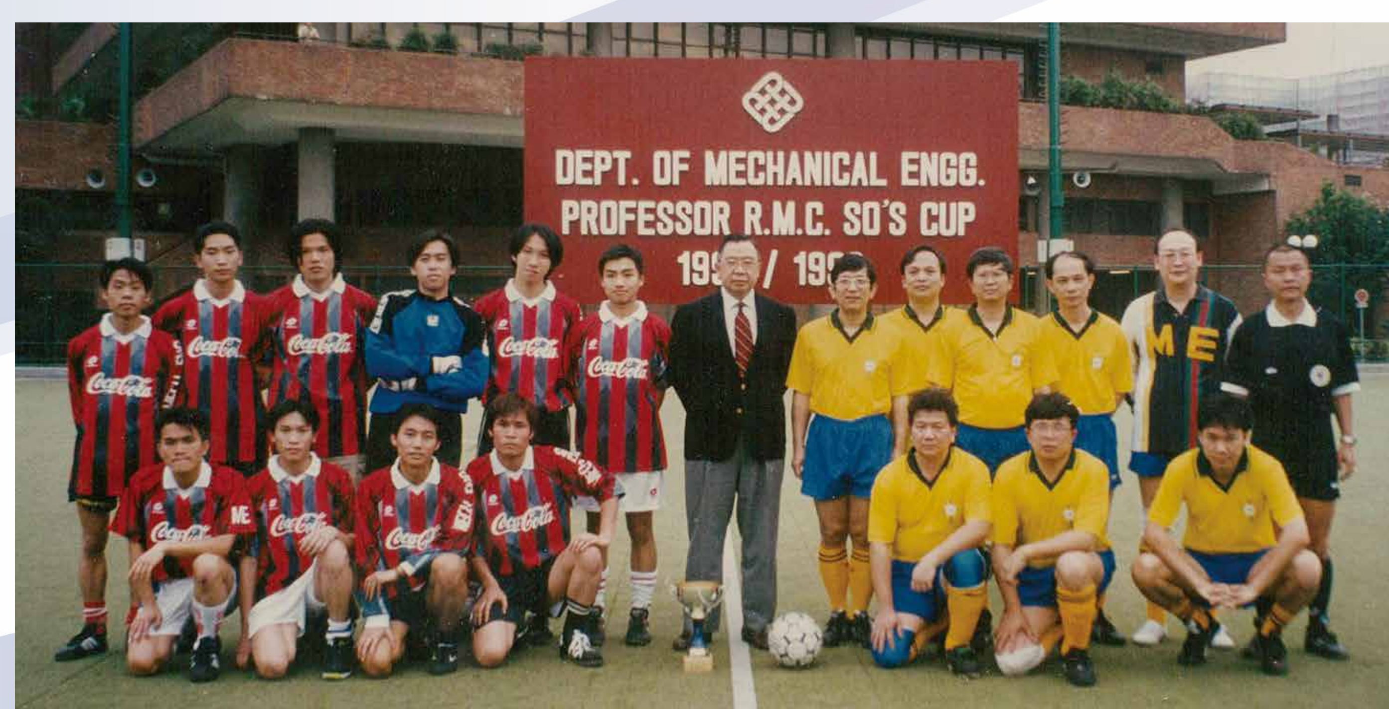
Staff-students Football Match (1998)