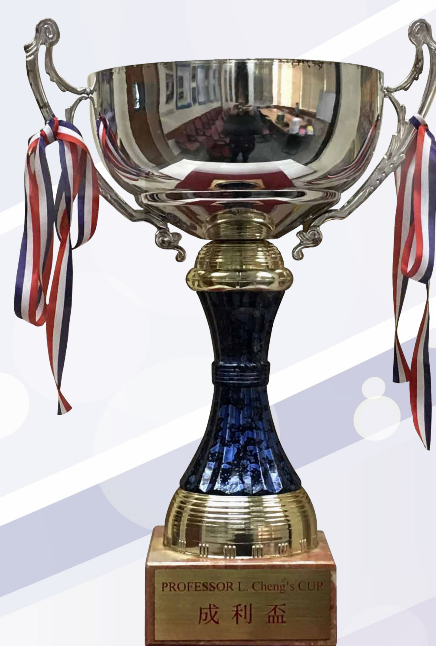
Department Head's Cup (蘇銘祖 / 呂堅 / 成利盃)