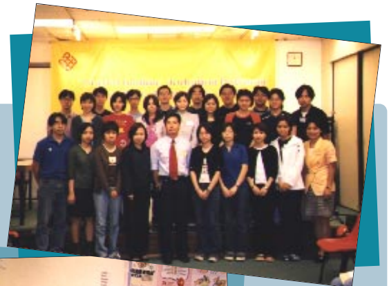
A group photo at the orientation.

With the continued support of the International Association for the Exchange of Students for Technical Experience (IAESTE) and academic departments, more than 40 students will be placed to receive job training in 18 overseas countries this year, including Austria, Australia, Brazil, Denmark, Finland, Germany, Greece, Mexico, Norway, Spain, Sweden, Switzerland, the United States and the United Kingdom.