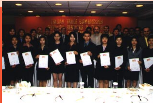
HTM students and the organizers of the cooking class at the opening ceremony.

The cooking class was the first in a series of a campaign launched by the Italian Trade Commission to promote Italian foods and wines.