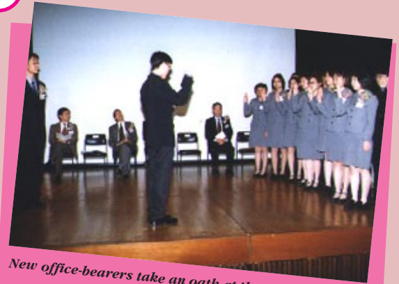
New office-bearers take an oath at the ceremony.