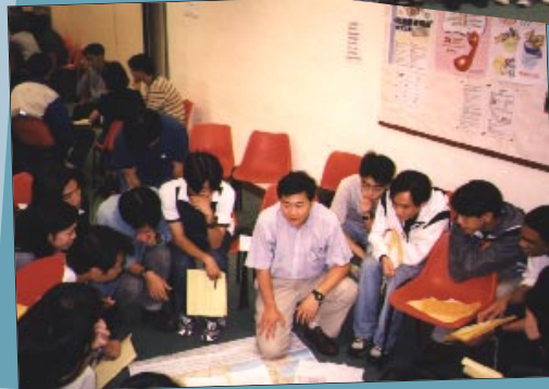
Students listen attentively to the sharing of a PolyU staff.

To prepare students who are taking up placement under the Programme, the Student Affairs Office of the University held three sessions of pre-placement orientation in May and June. The orientation featured keynote presentations by prominent speakers on such topics as Working in Different Cultures and Work Ethics and Attitudes . A number of enthusiastic PolyU staff members also shared their experiences of living and working in different countries to provide students with the best tips to lead a meaningful work life. ❖