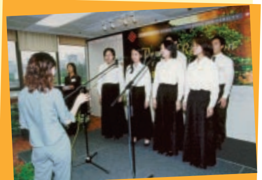
Students perform at the reception.

In addition, the donors have supported various PolyU student activities through the provision of sponsorships and subsidies, in which more than 4,500 students have participated. ❖