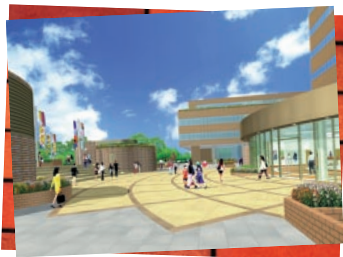
Entrance of the Jockey Club Auditorium and podium-cum-amphitheatre.