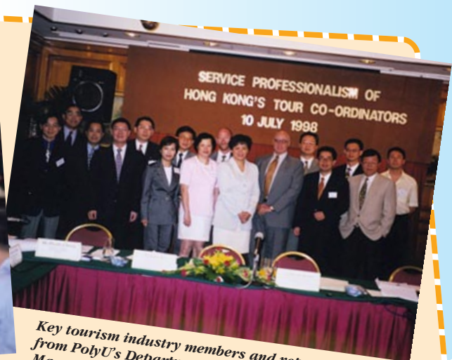
Key tourism industry members and representatives from PolyU’s Department of Hotel and Tourism Management gathered for a focus group meeting held in July 1998.