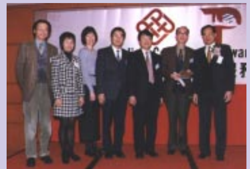
The second Merit winner team, made up of the Department of Applied Social Studies, the Industrial Centre and the Department of Business Studies, showed a good example of strong inter-departmental collaboration.