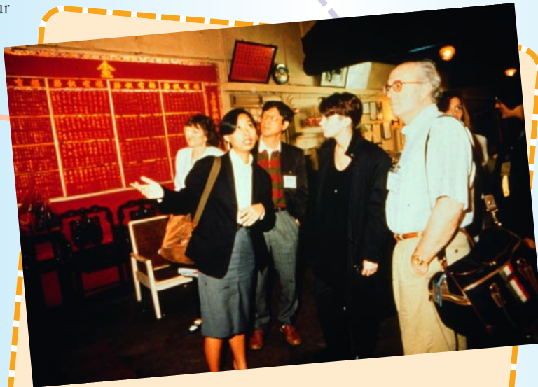
Tour guides play an important role in promoting Hong Kong to visitors from various parts of the world.

Monitoring system – It was recommended that a practical and enforceable monitoring and control system be adopted, including the issuance of photo identity