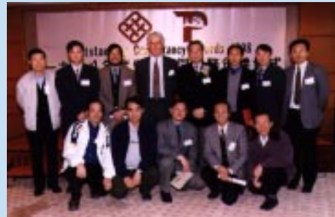
The team behind the big award – members from Department of Civil and Structural Engineering.

Winner: Department of Civil & Structural Engineering Merit: Department of Applied Biology & Chemical Technology Department of Applied Social Studies