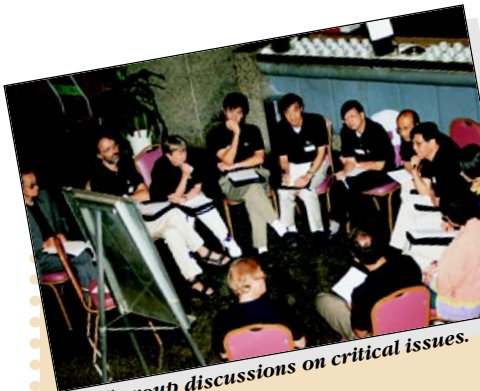
Small group discussions on critical issues.