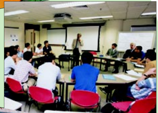
Commencement of the new programme MSc/PgD in Project Management on September 7.