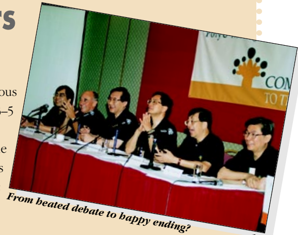
From heated debate to happy ending?

In the light of the current trends in tertiary education in Hong Kong, participants also exchanged their views on the University's marketing strategy and recruitment of high calibre students. The workshop also addressed issues involved in creating a congenial environment for staff and students, including the cultivation of staff morale, health and safety, and fostering a culture of achievement and commitment. The senior staff also shared their experience on good practices of teaching, research and departmental management.