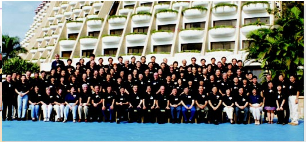
The workshop participants.