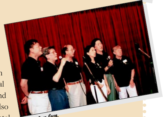
Time for fun.