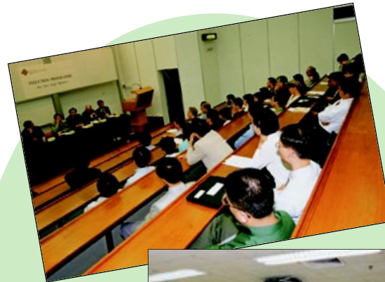
A total of 43 new staff members joined the Induction Programme organized by the Personnel Office on September 2 to gain an overview of the PolyU's latest developments.

Furthermore, the two Post-experience Certificate programmes, one in Industrial Safety and the other in Advanced Safety, have been separated from the Post-experience Scheme in Engineering to form a new scheme — the Post-experience Scheme in Occupational Safety and Health. The previous Higher Certificate programme in Pre-primary Care and Education has been upgraded to Higher Diploma programme in Pre-primary Education.