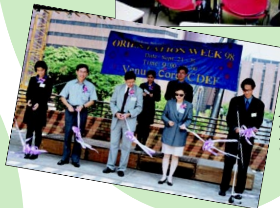
At the opening ceremony of Students' Union's Orientation Week.