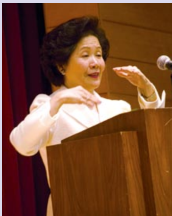
“From Chief Secretary for Administration of the HKSAR Government to Legislative Council Member” by Mrs Anson Chan, Legislative Council Member

As part of its student development initiatives, Hong Kong Community College (HKCC) organized a series of celebrity talks in March and April. Three renowned figures from the local political scene shared their insights with nearly 1,000 HKCC and secondary school students.