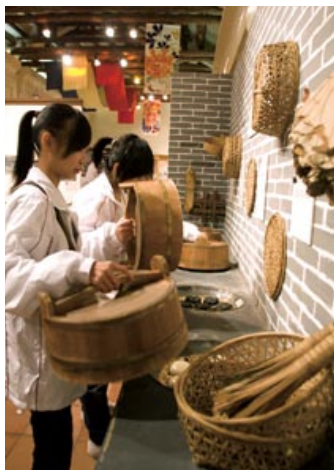
Students grasping the chance to trace the history of the Tai Fu Tai Mansion.

Pooling the efforts of over 70 teachers and students, HKCC put together the “Putonghua Training Programme for Student Tourism Ambassadors” to promote the use of Putonghua in introducing local cultural and historic sites. Two hundred and eighty students from 40 secondary schools were provided training in Putonghua skills and Hong Kong culture through workshops, tourism subject studies and field trips.