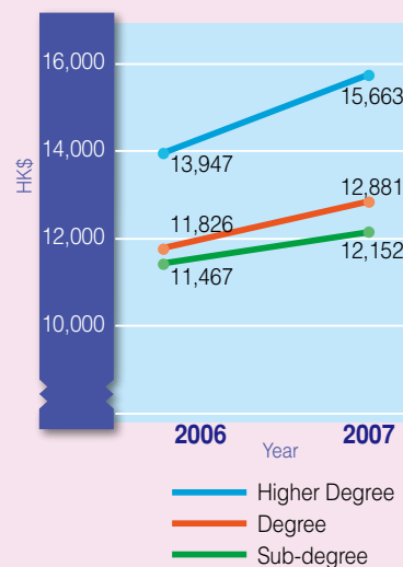
Average monthly salary of graduates in 2006 and 2007