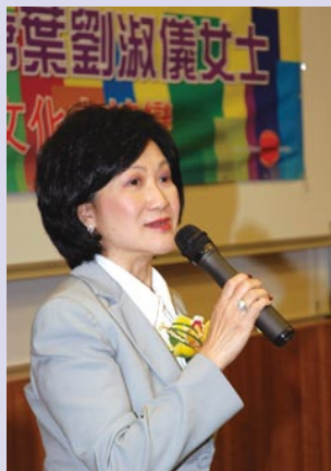
“Evolvement of the political culture in Hong Kong” by Mrs Regina Ip, Chairperson of Savantas Policy Institute