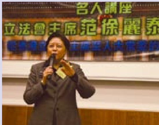
“From Legislative Council President to Hong Kong Deputy to the Tenth National People’s Congress of the People’s Republic of China” by Mrs Rita Fan Hsu Lai-tai, Legislative Council President