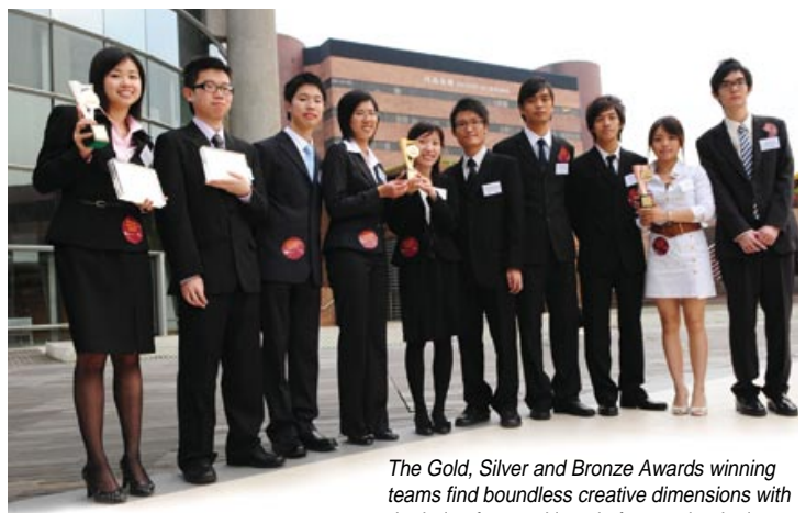
The Gold, Silver and Bronze Awards winning teams find boundless creative dimensions with the help of networking platform technologies.

Out of more than 60 student teams participating in the competition, a team of PolyU-affiliated Hong Kong Community College (HKCC) students scooped the Silver Award and the CIM Marketing Award sponsored by The Chartered Institute of Marketing (Hong Kong), while the Gold and Bronze Awards went to students from School of Continuing and Professional Studies of The Chinese University of Hong Kong.